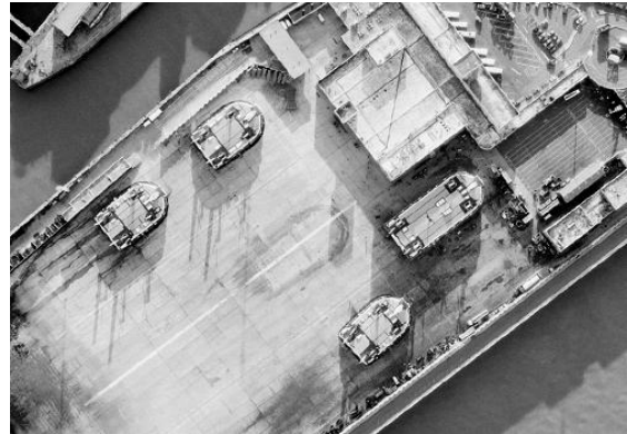
Dover, Kent, UK (NCAP-000-000-296-891)