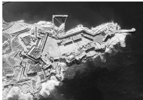
Fort Ricasoli, Malta (NCAP-000-000-293-057)

Large parts of an aerial survey of Malta in 1967 have been digitised and uploaded to the NCAP website.