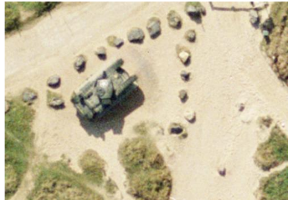
Graye-sur-Mer, Normandy, France

High-quality colour aerial images of the Normandy beaches in 1993 will be included in the first release of images from the AIRBUS Collection. Visible in the image below is a Churchill AVRE used on D-Day 6 June 1944 and preserved at JUNO Beach, Graye-sur-Mer, France.